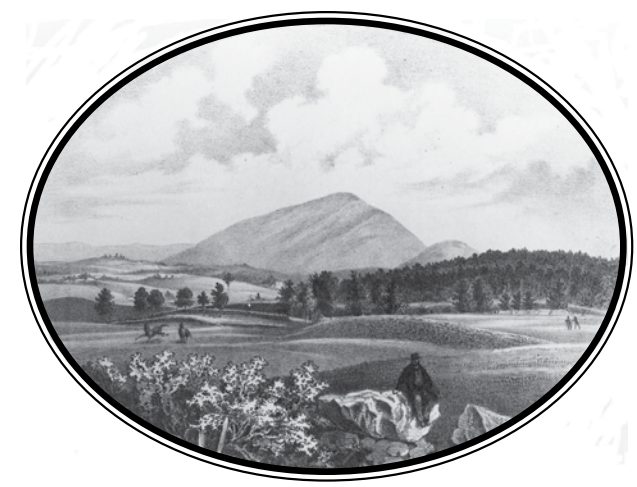
view of Mt Ascutney, from Knapp Pond, circa 1860